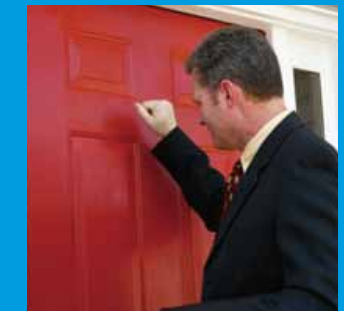
<Door to Door Sales>

M3 SKY series' slim body and light weight will lead you to work at ease. Also, its strength against external impact enables you to carry M3 SKY series anywhere you need to process data not only in a warehouse with full of stuffs but also in tough outside environment. It has been already deployed and widely used in various field such as Logistics, Government branches, Asset management and so on. Its ways to collect data via scanner, RFID, camera and Bluetooth make it possible to play a role as an excellent companion of your work.