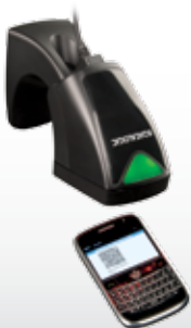
Base can be secured to a counter or wall for fixed applications